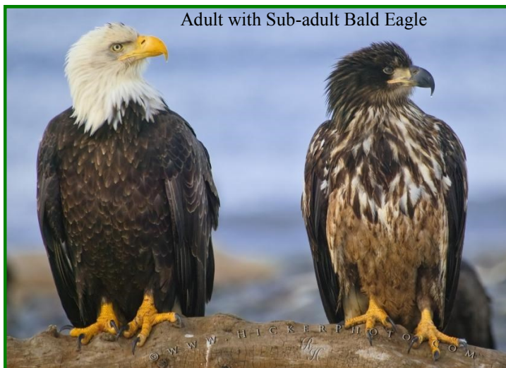
Adult with Sub-adult Bald Eagle

If any birds of these are observed, disturbance should be minimized until they leave the area and the Forest Service biologist should be notified. Photographs are appreciated.