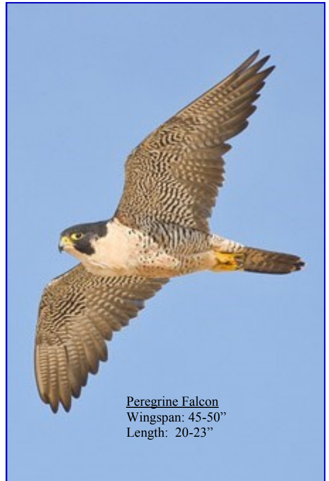
Peregrine Falcon Wingspan: 45-50" Length: 20-23"