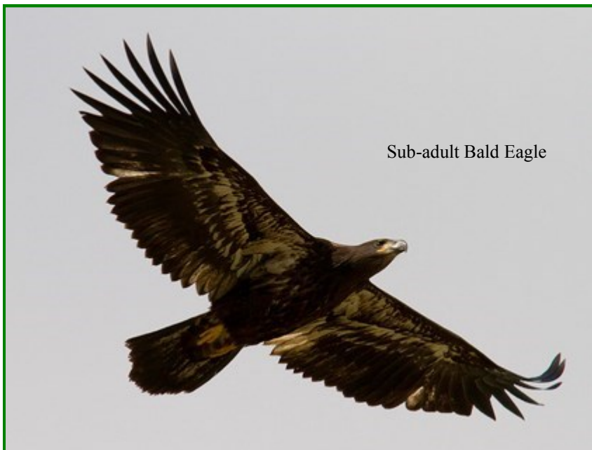
Sub-adult Bald Eagle

If any birds of these are observed, disturbance should be minimized until they leave the area and the Forest Service biologist should be notified. Photographs are appreciated.