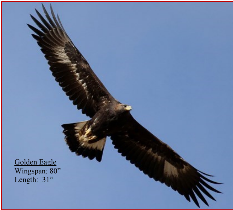
Golden Eagle Wingspan: 80" Length: 31"